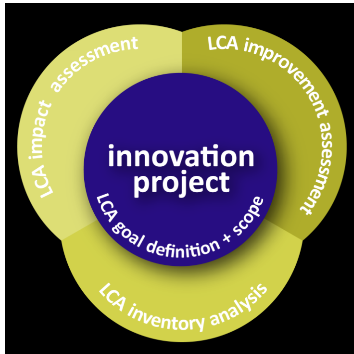
Interrelation of LCA Phases